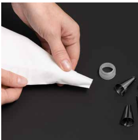
2. Push the larger piece right up to the end of the bag and look for a suitable cut point.