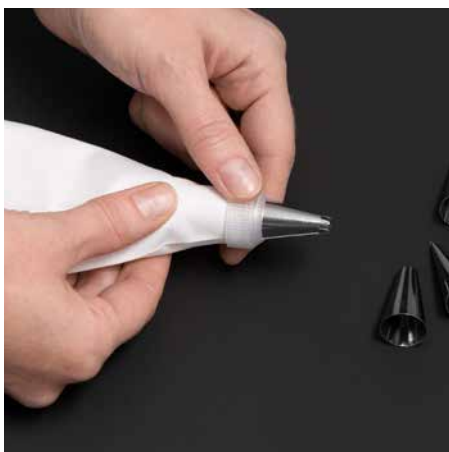
5. Screw the nozzle into place.