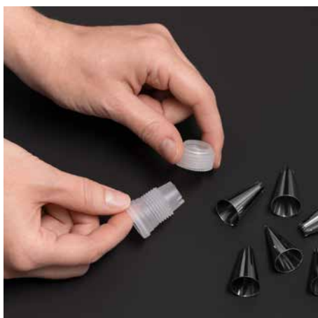
1. Unscrew the plastic parts.