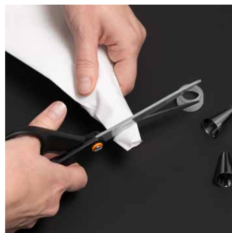
3. Cut the end of the bag just enough to leave the threads inside the bag.