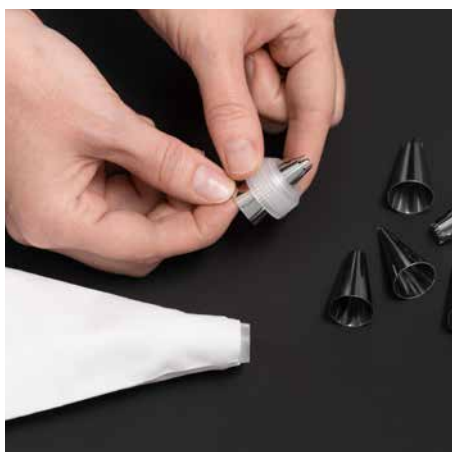
4. Add the nozzle you want to the smaller plastic part.