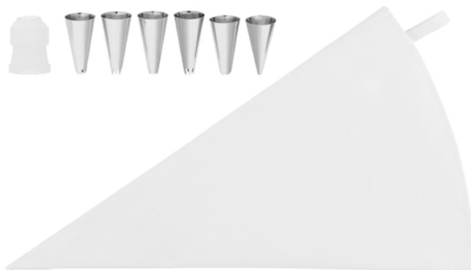
315787 Maku piping set